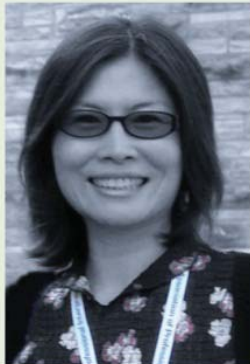
Ping Cross CHI™

Meeting & conference Court hearing & trial Doctor visit & Workers' Comp Technical & specialty translation Transcription DTP & localization